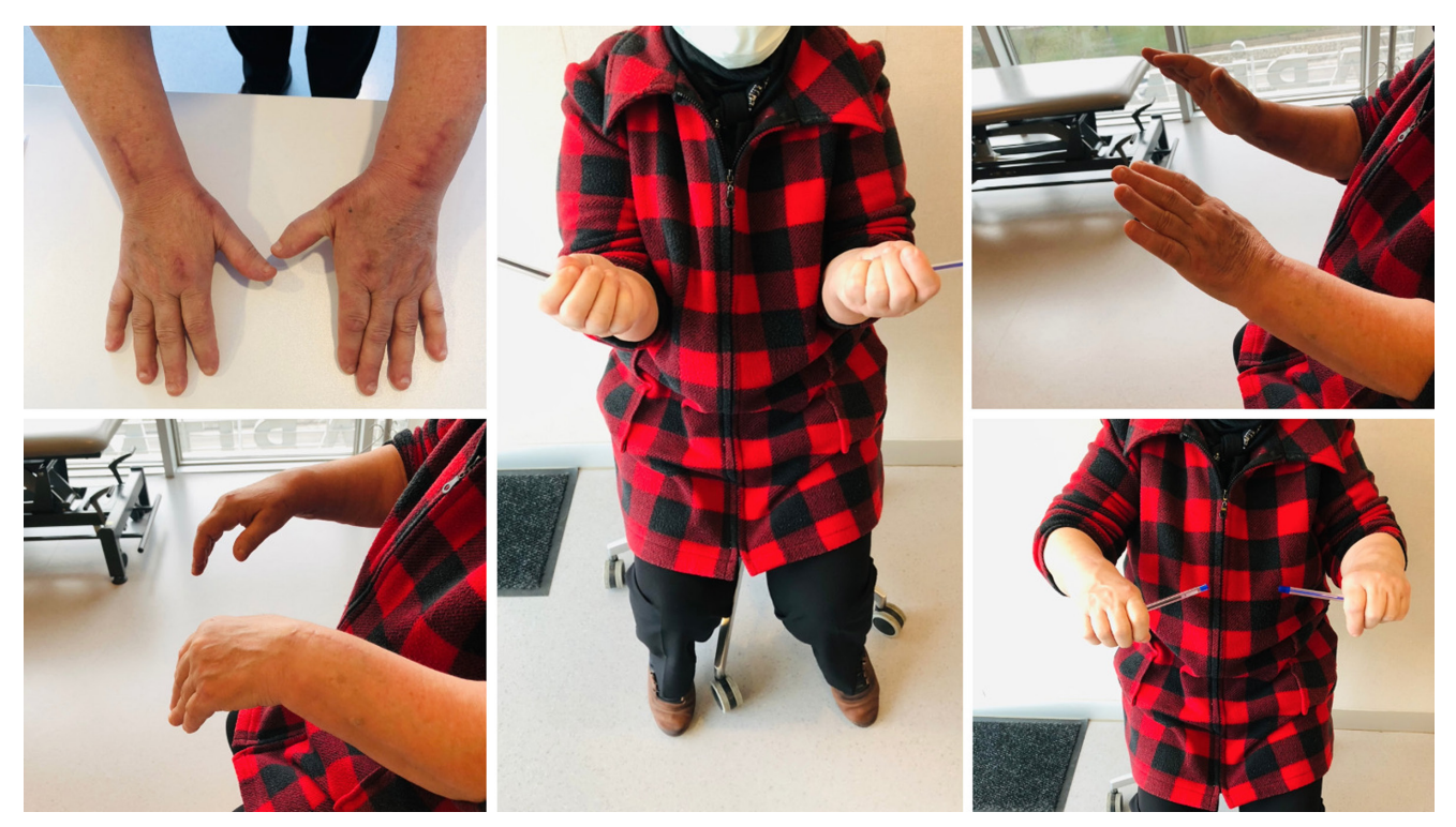
Figure 3. Clinical picture of the patient at 8 weeks after surgical intervention. The patient was nearly pain-free, and the full range of motion was achieved at this time point.