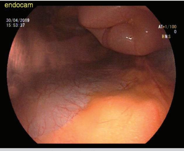
Figure 4. Peritoneal cavity and small intestines.