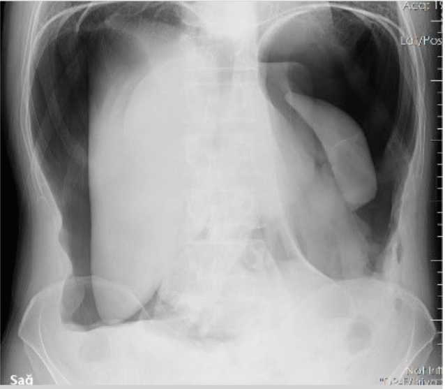
Figure 1. Diffused free air in standing plain abdominal radiography.