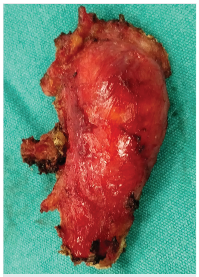
Figure 2. Excision material

Local wide surgical excision with a margin of at least 10 mm is considered good clinical practice as the first choice for treating patients with endometriosis externa (7,9,10,15). Depending on the size of the defect, repair of the formed defect can be done using primary repair or prolene mesh (15). In our study, prolene mesh was used in one patient and primary repair was performed in 13 patients using nonabsorbable sutures. In a study by Francica (16), the mean lesion size was 41 mm for large endometriomas and 18.2±5.17 mm (range: 7-26 mm) for small endometriomas. Tumor size can be difficult to diagnose; According to Gajjar et al. (17) gave a variation of the palpation score of 50x40 mm, but later using ultrasound found that the nodules had three dimensions of 18x17x17 mm. Additionally, in a study investigating the location of the tumor according to the midline, left localization was found to be more common (18). In our study, the mean tumor diameter was found to be 3.48 (1.4-6.0) cm radiologically, and 4.53 (2.5-6.5) cm in per-operative measurement. It was determined that the placement was more on the left (n=8).